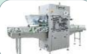
AUTOMATIC TRAY SEALER