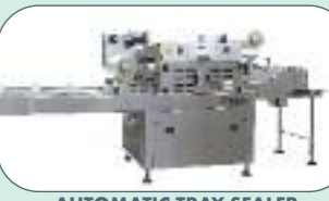
AUTOMATIC TRAY SEALER