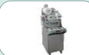
SEMIAUTOMATIC TRAY SEALER