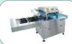
AUTOMATIC TRAY SEALER