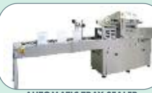
AUTOMATIC TRAY SEALER